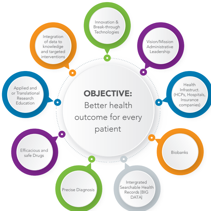
This figure highlights the various components that exist to establish an ecosystem that drives the objective of “better healthcare for every patient”

The precision medicine landscape can be characterized as having all the components of an ecosystem, to enable a vision toward equal and more cost effective healthcare. This entails being able to accurately diagnose and treat each patient